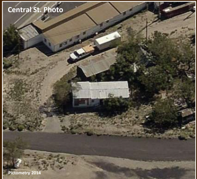
Central St. Photo